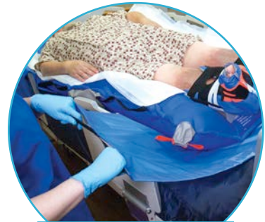
LOW-FRICTION GLIDE SHEET