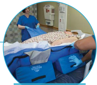
30° BODY WEDGES