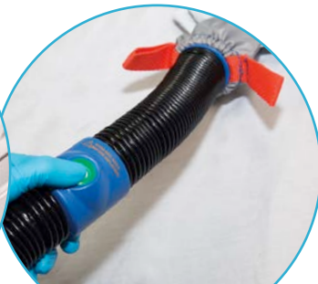
POINT OF CARE POWER SWITCH