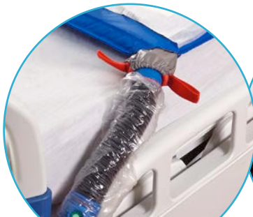
HOSE PROTECTION SLEEVE

Boosting and repositioning patients in bed is a high-frequency task. The Prevalon AirTAP XXL System helps reduce the risk of injury to nurses and other caregivers by providing an ergonomically friendly method of turning and repositioning larger patients.