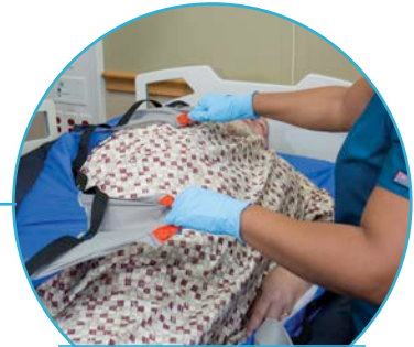
EASY ROLL HANDLES