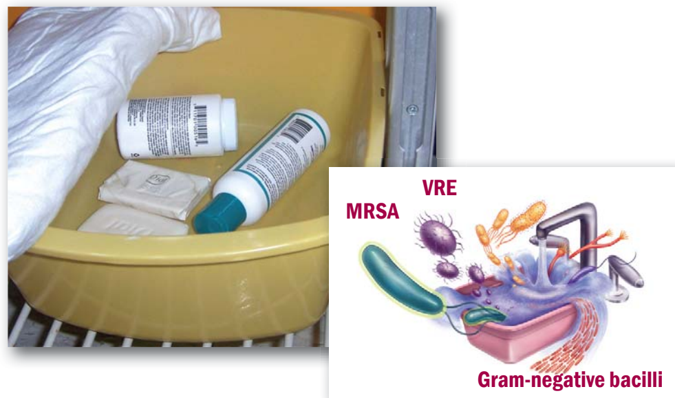
Figure 1: Bath Basin can be reservoir for pathogens

Support for this study was provided in part by Sage Products, Inc.